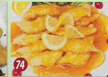
Salt &amp; Pepper Squid 14.95 ✓