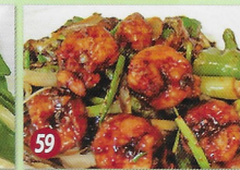
Shrimp w/ Snow Peas 15.95