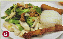
L3 Beef or Chicken Broccoli 9.75