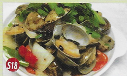
$18 Whole Clam w/ Black Bean Sauce 16.95 豉汁炒蜆