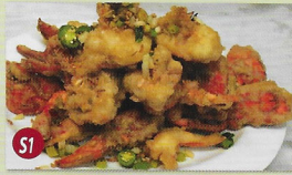
$1 Whole Live Lobster Seasonal Cooked in Chinese Style w/ Ginger or Salt & Pepper 龍蝦 (港式薑蔥炒 或 脆香椒鹽)