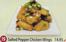
19 Salted Pepper Chicken Wings 14.95 ✓