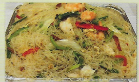
Singapore Stir Fried Thin Rice Noodle