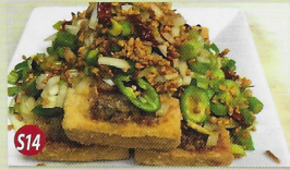
$14 Fried Stuffed Bean Curd w/ Salt & Pepper 15.95 椒鹽釀豆腐