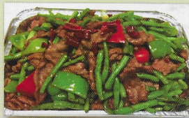
Beef with String Bean