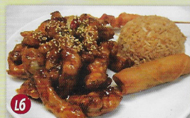
L6 Sesame Chicken 9.75