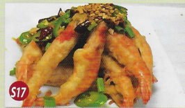
$17 Salt & Pepper Shrimps (shell on) 15.95 椒鹽大蝦 (有頭)