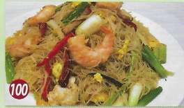
100 Singapore Stir Fried Thin Rice Noodle 13.95