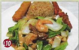
L10 Chow San Shein 10.25 Shrimp, Chicken and Beef