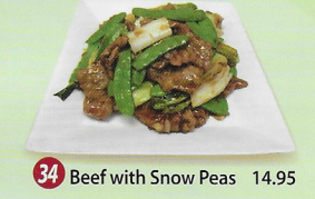
34 Beef with Snow Peas 14.95