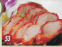
Jing Do Pork Chop 13.95