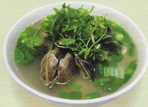
18 Clam Soup with Tofu 13.95