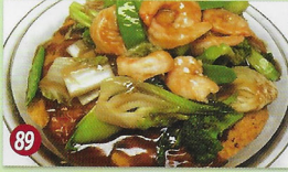
89 Chef's Special Pan Fried Noodles 14.95 Shrimp, Chicken and Pork