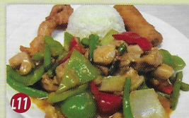
L11 Curry Chicken or Beef 9.75