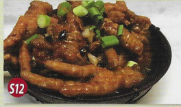
$12 Chicken Feet w/ Salt & Pepper or Black Bean Sauce 16.95 脆皮或豉汁鳳爪