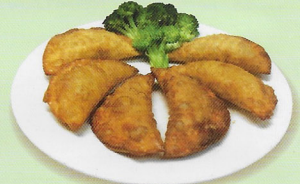
7 Curry Beef Patty (6) 8.95