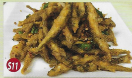
$11 Crispy Fried Dilis 15.95 酥炸魚仔