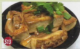
$13 Stuffed Bean Curd in Clay Pot 15.95 客家釀豆腐煲