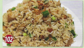
102 Salty Fish with Diced Chicken Fried Rice 13.95