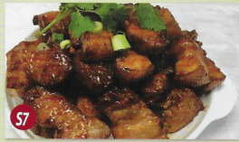
$7 Adobo Pork w/ Skin 16.95 客家五花肉