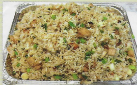
Salty Fish w/ Chicken Fried Rice