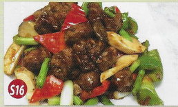
$16 Black Pepper Steak 17.95 Special New York Steak 黑椒牛柳粒