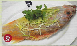
$2 Fresh Rock Cod or Halibut Seasonal Steamed / Fried / Sweet & Sour / Salt & Pepper 深水石斑 / 龍利 (清蒸 或 甜酸 或 椒鹽)