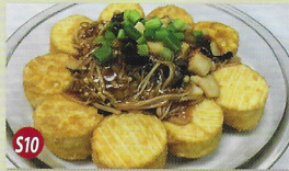
$10 Triple Mushroom w/ Egg Bean Curd 15.95 三菇玉子豆腐