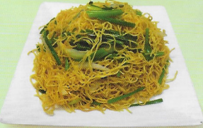
Fried Egg Noodles 11.95