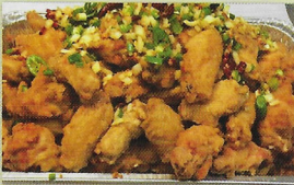
Salt & Pepper Chicken Wings