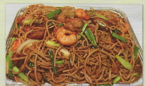
House Special Lo-Mein