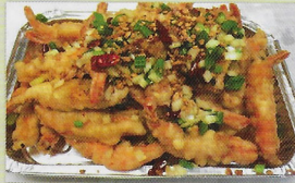
Salt & Pepper Shrimp