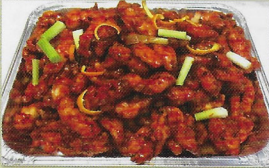
Orange Flavors Chicken