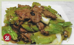
$6 Bitter Melon with 15.95 Fish Fillet / Shrimp / Beef / Chicken 苦瓜炒魚片 / 蝦 / 牛 / 雞