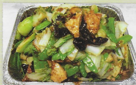
Tofu with Mix Vegetable