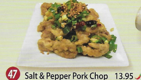
47 Salt &amp; Pepper Pork Chop 13.95 ✓